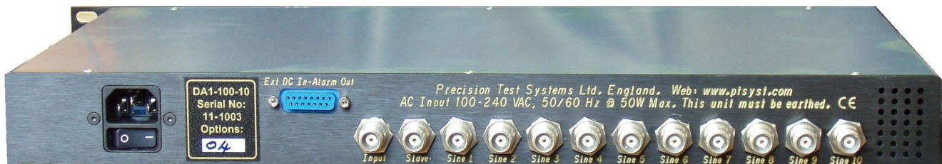
DA1-100-10 Rear view (with option 04 TNC Connectors).

Precision Test Systems also manufactures the PTS50 and DA1010 series of distribution amplifiers. These models are lower cost alternatives to the DA1-100-10 but still give very good performance.